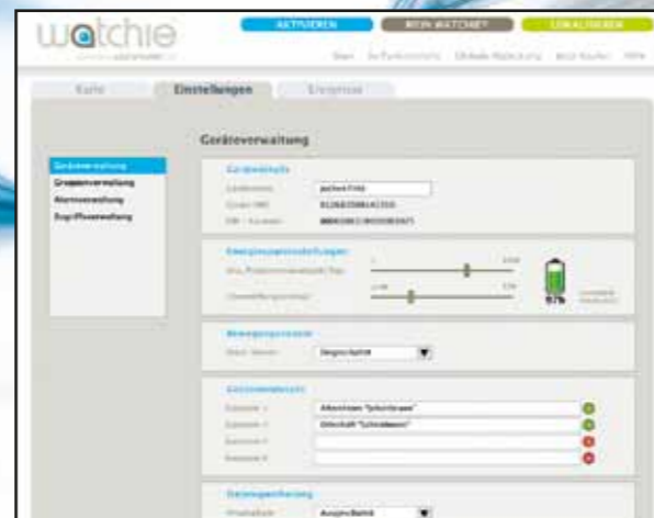
View Device Management

WATCHIE ® is a digital aid for sufferers of dementia. WATCHIE ® has been developed from the Swiss company, LOSTnFOUND Ltd, which has been very successful in previous years in the business of Vehicles Tracking and Moveable Assets. Now, in conjunction with partners from similar industries, a product has been developed to improve the lives and conditions for sufferers of Alzheimer's and dementia.